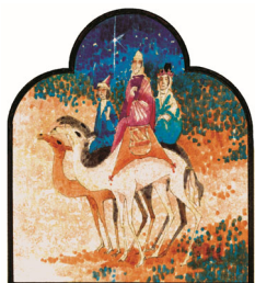
Magi from the east arrived