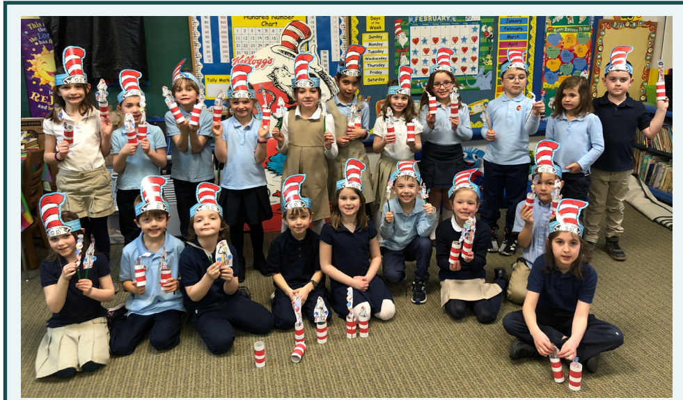
First grade turned Dr. Seuss's birthday into a week-long celebration! The class proudly displays their Thing 1, Thing 2 and The Cat in the Hat stick puppets.