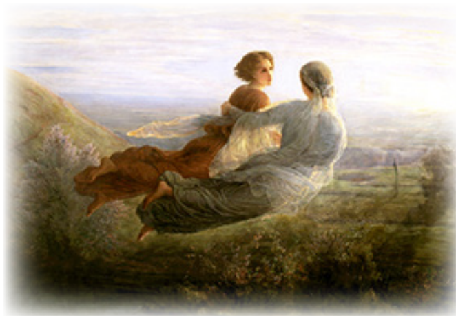
The Soul's Flight

Louis Janmot 1814-1892