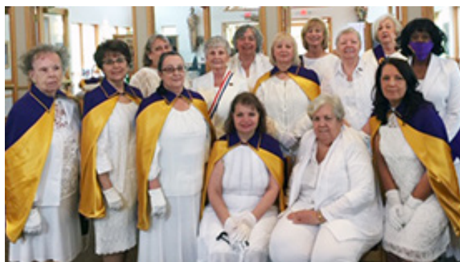
Above photo from 54th Biennial CDA State Convention in 2021. Will you be a part of the team this year?